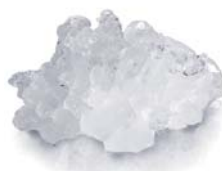
Residual water content 25%

Ice in its most natural form, made at a temperature just below zero degrees Celsius, contains 25% residual water content, making it very moist. Its flake shape makes it extremely versatile and very simple to use effectively.