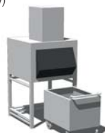
MF 36+SIS700 (sold separately)

This product qualifies for the following listings: