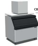
MF 36+SB550+Top (sold separately)