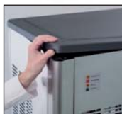
ABS plastic top cover