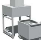
MF 36+SIS300 (sold separately)